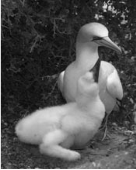
He pīpī tākapu me tana matua

Ka pakeke te kōhungahunga, ka rere atu ki Ahitereiria mā Te Tai-o-Rehua i te mutunga o te raumati. Ka noho aua manu i reira mō ngā tau e rima pea. Kātahi anō aua manu ka hoki mai ki Aotearoa.